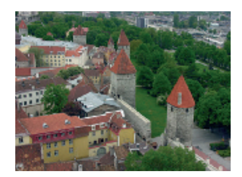
Another view of Tallinn.

A long time ago, bone fractures in Estonia were treated also by general surgeons. Orthopaedic education and practice have been organised better. Since traumatology and orthopaedics were separated from general surgery. In 1984 a chair of orthopaedic surgery and traumatology was established at the Faculty of Medicine at Tartu University. Before that there were several ways of becoming an orthopaedic surgeon. Today, students have to complete six years of general medical training with an additional year if they want to become general practitioners.