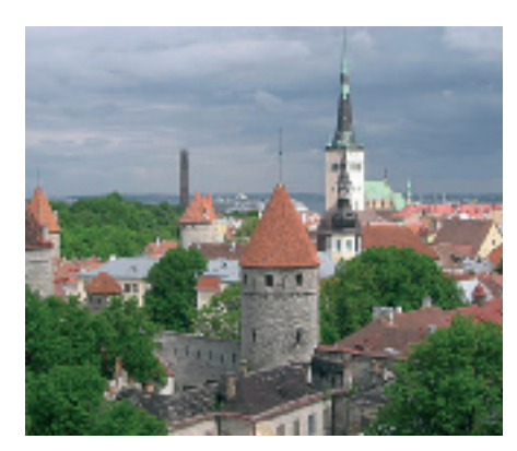
View of Tallinn.

Nearly all the inhabitants of Estonia are covered by the National Health Insurance system. Practically all the hospitals are owned by the State and most doctors work for the National Health Service. Altogether, there are nine orthopaedic departments in Estonia with 380 beds for orthopaedic pathology and for patients with musculoskeletal trauma. The only private orthopaedic unit, with 10 beds, is in the Magdaleena hospital, in Tallinn. Thoracic and abdominal trauma, as well as urological trauma are treated in that unit. In orthopaedic trauma there are currently two main problems: complex intraarticular fractures in multiply injured persons and osteoporotic fractures in elderly patients. Various degenerative conditions, especially osteoarthrosis of the large joints and spine, have assumed greater clinical importance recently.