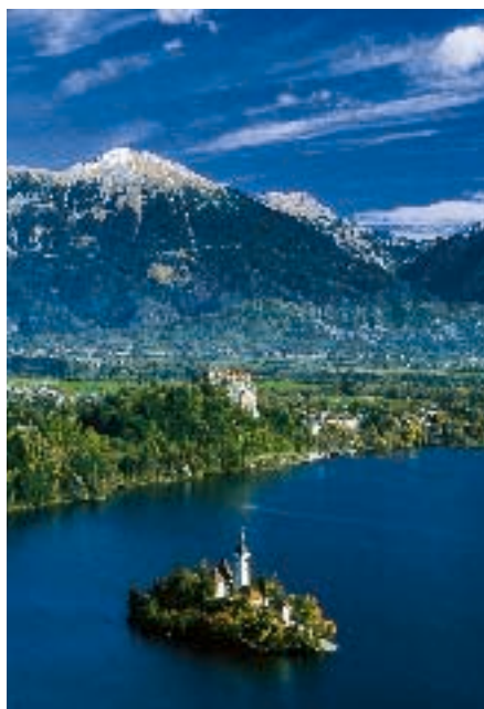
Bled, jewel of the Julian Alps

From a historical point of view, Ljubljana was the place where the