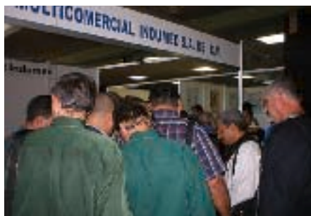
One of the exhibitors