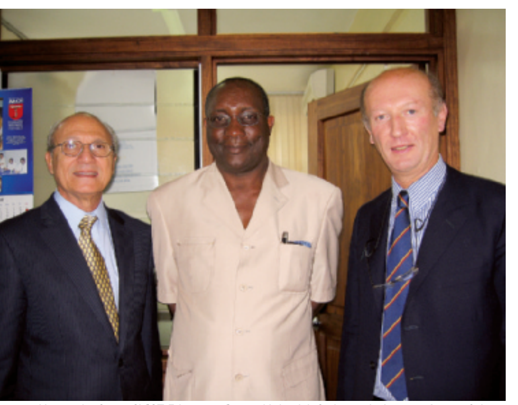
Visit to the future SICOT Education Centre, Muhimbili Orthopaedic Institute, Dar es Salaam

Education Centres. At present, SICOT has the local human resources, knowledge and expertise to establish Education Centres in many countries. In addition, we have senior faculty members ready to take part in local teaching and training missions. The partnership with WHO will enable us to activate and sponsor this programme. The first step is to identify the sites which have the human resources and facilities to create a SICOT Education Centre and, in parallel, to start shortly a pilot project with 3 to 4 centres in synergy with WHO in Asia, the Middle East, sub-Saharan Africa and in the Latin American countries.