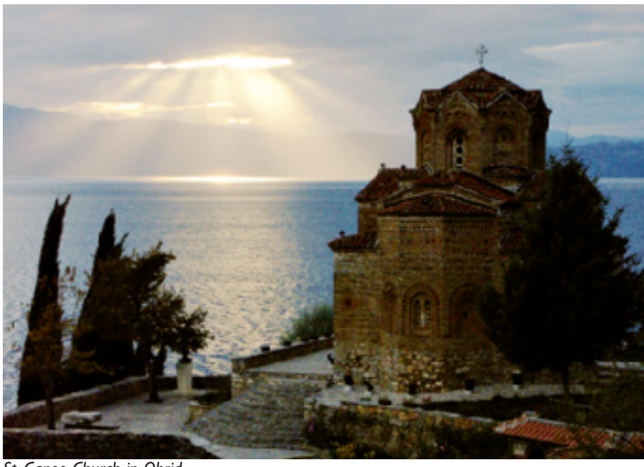
St. Caneo Church in Ohrid

Bronze figurine of Daedalus from III-II century B.C. (Plaoshnik 2007, Ohrid)