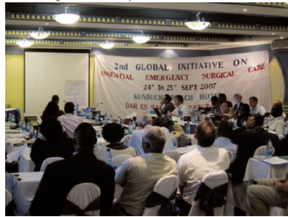
The WHO meeting in Dar es Salaam in September 2007

The second programme is on "Priority Medical Devices". I was invited as an expert at an informal consultation in Geneva in October 2007. One of the major tasks of this group is to establish what they call "Gaps". Gaps are defined as disparities between healthcare needs and