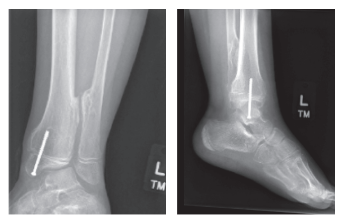
AP and lateral radiographs of the left ankle showing the medial hemiepiphysiodesis and excision of the distal tibia osteochondroma that was abutting the fibula

The patient was submitted to a medial hemiepiphysiodesis of the left ankle and excision of distal tibia osteochondroma and a right laminectomy of C6 with en bloc excision of the cervical osteochondroma.