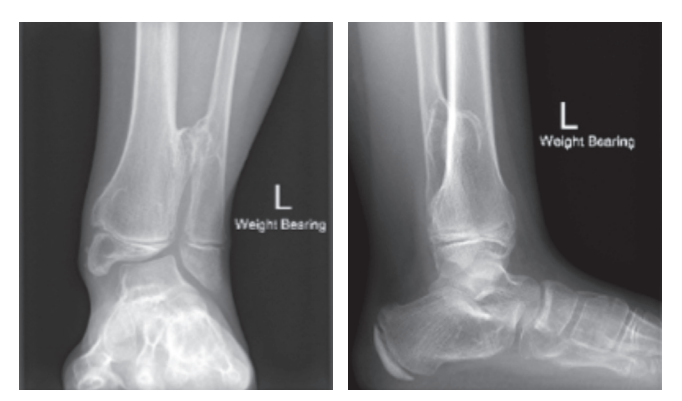
AP and lateral weight bearing radiographs of the left ankle showing increased ankle valgus, note the distal tibia osteochondroma abutting the fibula

When the patient was 8 years old she presented to us with complaints of left ankle pain and deformity.