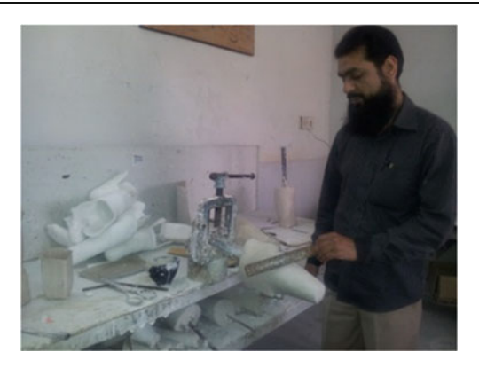
Fig. 4 Rectification of mould for manufacturing of the socket of the prosthesis

In the first 1,700 patients that presented to DHQ Mansehra 46 patients had amputations with 23 of the upper and 23 of the lower limbs (Fig. 2). Meanwhile in Muzaffarabad camp within the first days, 20 injured were amputated, of which 11 had lower limbs and had upper limbs amputated. The total number of body parts amputated was 112, of which "below-knee" was the most frequently performed amputation.