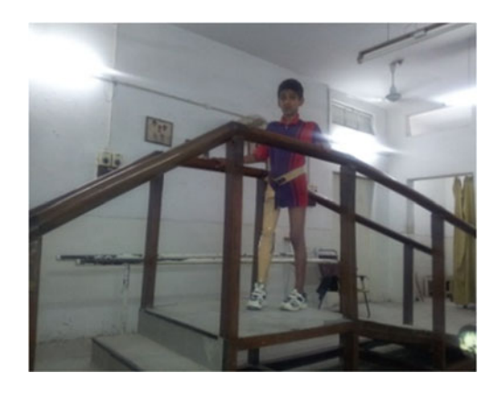
Fig. \bf 3 A young boy being trained after fitting of an above knee prosthesis on ramp and stairs

In our centres a total of 19,700 patients (with earthquake injuries) were received in the first seven months (emergency transfers and referrals from small centres in farflung mountains), of which 12,000 were treated in Mansehra and 8,700 in Muzaffarabad. Table 1 shows the distribution of injuries in these patients. Of these injuries 58 % were of the lower limb, 28 % of the upper limb and 10 % of the pelvis. Of the 19,700 injured registered in our centres in the first seven months, 4,772 underwent implant surgeries like external fixation, nailing, plating (DCP, DCS, DHS, etc.), hemiarthroplasties (AMP), prosthesis etc. Treatments such as casting, traction, debridement, amputation, skin grafting and manipulations were performed in 14,928 patients. The statistics of distribution of amputation cases is given in Table 2.