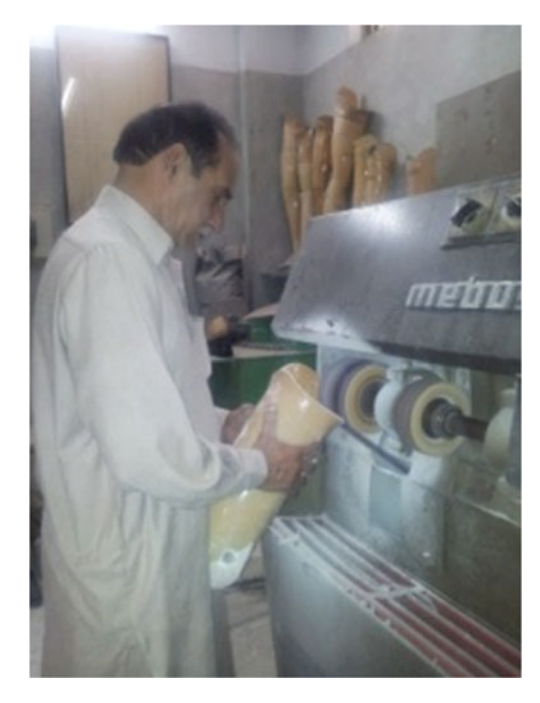
Fig. 5 Final shaping of the socket of an above knee prosthesis

Earthquakes are known to cause mass deaths and injuries with devastating effects on infrastructure and civil structure [4]. The October 2005 earthquake left a colossal economic loss of over US$5 billion and a challenging task of 13,000