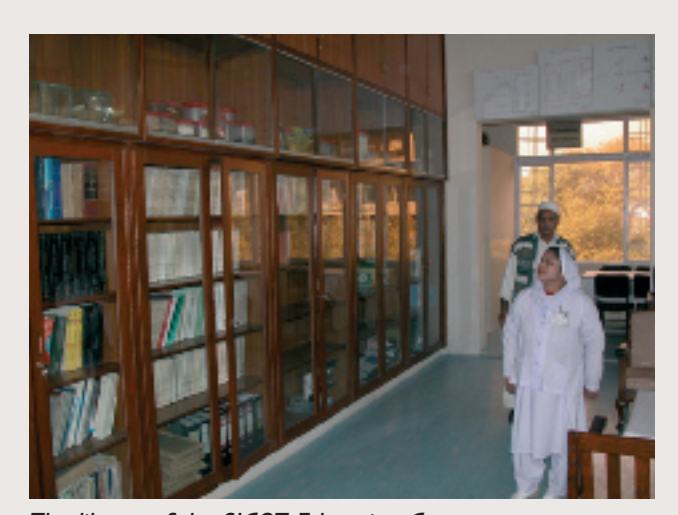
The library of the SICOT Education Centre