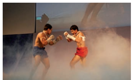
Muay Thai (Thai Boxing) performance