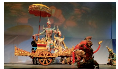
"KHON YOK ROB" performance