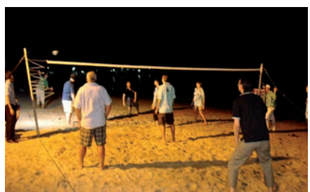
A volleyball match at the Fun Night