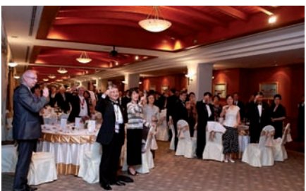
A toast to SICOT and RCOST