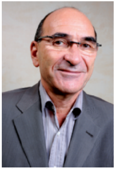
Prof Jean-Pierre Courpied

the Editorial Board caused quite a stir at the International Committee (not yet a Council in 1993) and after much recrimination we finally secured the best of all terms; namely the retention of our original publisher under the same contract as that proposed by the prospective publisher!