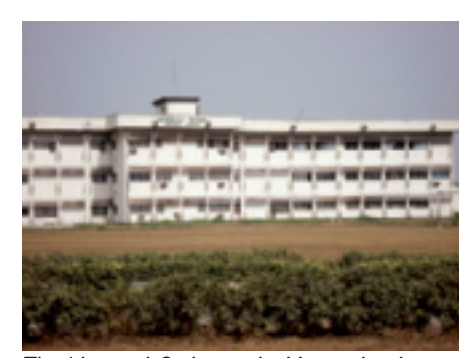
The National Orthopaedic Hospital in Lagos

The oldest establishment for organised orthopaedic practice in Nigeria is the Igbobi Orthopaedic Hospital, Lagos. This institution started as a mil-