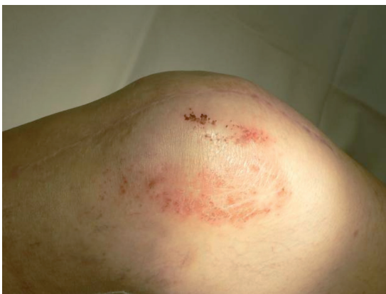
Figure 1. Eczematous reaction after TKA.

The wound healed without complications and the eczema disappeared. Furthermore, at the last follow-up session in August 2010, 18 months after the revision, the mobility of the patient was excellent, with values of E/F 0/0/115°. The knee pain had disappeared.